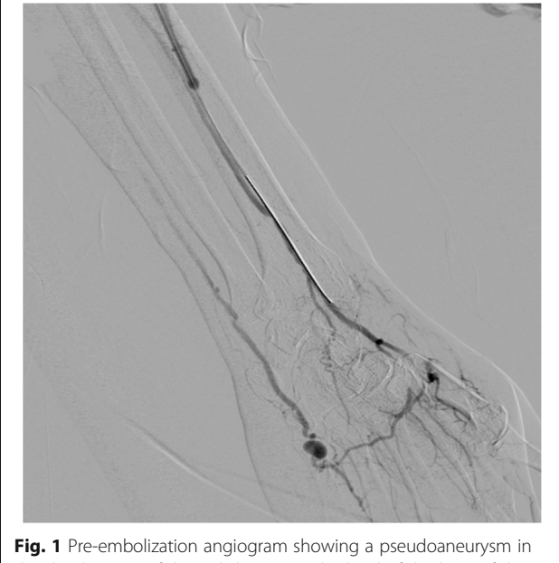
the distal aspect of the radial artery at the level of the base of the first metacarpal

Immediately following this procedure, the hand was noted to be increasingly tense and swollen with worsening skin blistering and weeping, likely related to the hand not being elevated as well as injection of contrast in to the area. The hand movement was significantly more restricted due to the swelling and pain. Sensation was intact. Patient continued to deny paresthesia. Thumb pulse ox was 95%. Radial pulse 2+ right femoral pulse 2+. The patient was monitored in the intensive care unit (ICU) for frequent neuro vascular checks. Overnight, there was improvement in the pain and swelling, which over the next day improved with elevation. The patient