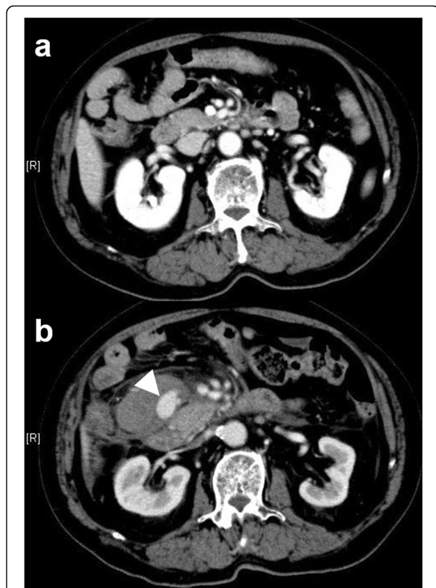
Fig. 1 Contrast-enhanced computed tomography (CT) findings at the previous hospital. a CT examination at admission to the previous hospital showed no abnormal findings around the superior mesenteric artery and vein or the duodenum. b CT images obtained on the fourth day after symptom onset demonstrated a newly developed hematoma with a pseudoaneurysm (white arrowhead) in the mesentery of the duodenum

pseudoaneurysm of the anterior inferior pancreaticoduodenal arterial branch and early visualization of the portal vein was found (Fig. 2a, b). We diagnosed an APF caused by rupture of a pseudoaneurysm. We could not advance a 1.98-French microcatheter (Parkway Soft; Asahi Intecc, Seto, Japan) to the APF or even to the pseudoaneurysm because the artery was narrow and meandering (Fig. 2c). Thus, transcatheter arterial embolization (TAE) using fibred embolization microcoils (Tornado Embolization Coil; Cook Medical, Bloomington, IN, USA) could only be performed upstream of the pseudoaneurysm. Transportal embolization with the percutaneous transhepatic approach was subsequently added. The right anterior superior subsegmental branch of the intrahepatic portal vein (P8) was punctured under ultrasonographic guidance, and a 5-French angio-sheath was inserted into the portal trunk. A 5.2-French catheter with an occlusive balloon (9-mm diameter, Selecon MP Catheter; Terumo Clinical Supply, Gifu, Japan) was placed at the outflow tract of the APF. A 1.98-French microcatheter (Parkway Soft; Asahi Intecc) was then introduced into the pseudoaneurysm through the APF in a retrograde fashion