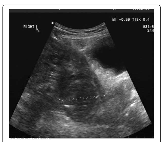
Fig. 1 Transvaginal ultrasound image of the right uterine artery pseudoaneuyrsm

Ugwumadu et al. CVIR Endovascular (2018) 1:31 Page 2 of 4