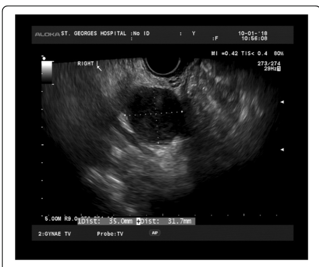
Fig. 4 Transvaginal ultrasound image of the thrombosed right uterine artery pseudoaneuyrsm

Ugwumadu et al. CVIR Endovascular (2018) 1:31 Page 3 of 4