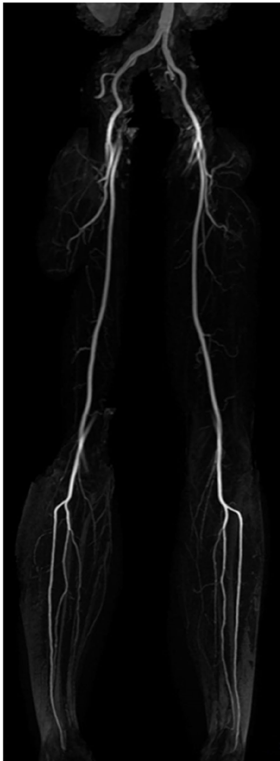
Fig. 2 Magnetic resonance angiogram of the peripheral arteries in maximum - intensity - projection. Upon MR-angiography of the lower extremities, inconspicuous vascular anatomy was seen excluding vascular stenosis or atherosclerotic alterations down to the ankle level as cause of the pain in the left foot