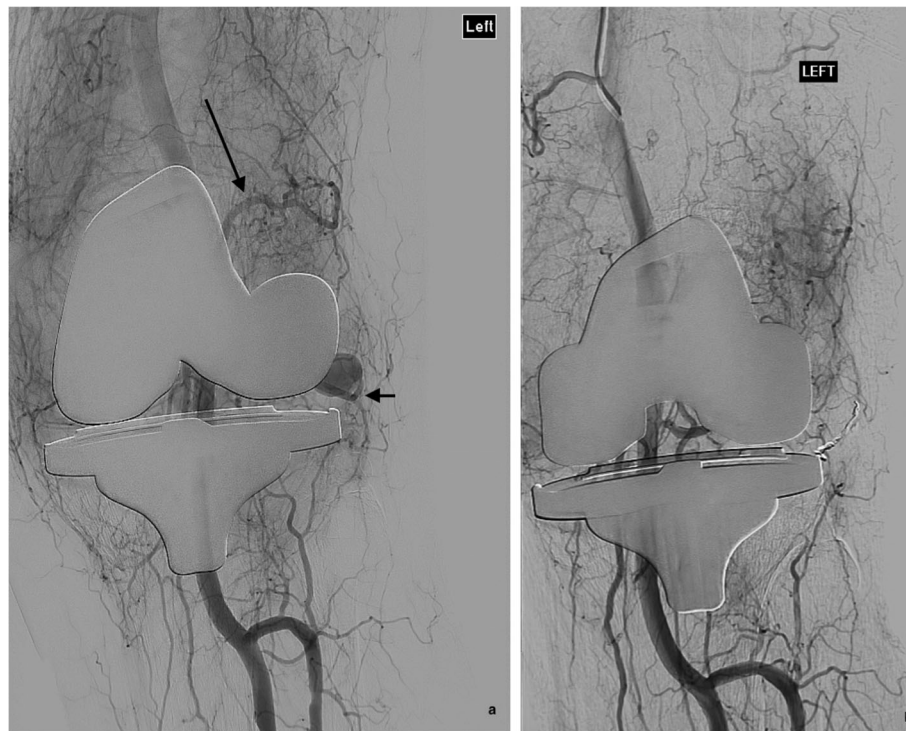
Fig. 2 a Angiography demonstrates abnormally increased vascularity about the total knee replacement prosthesis and a hypertrophic and tortuous superior lateral geniculate artery (long arrow). There is a pseudoaneurysm at the anterior aspect of the knee joint arising from the inferior lateral geniculate artery (short arrow). b There is successful occlusion of the pseudoaneurysm following coil embolization (2 × Ruby coils, 3 mm × 5 cm and 4 mm × 6 cm) of the feeding artery

pathologically observed synovial hypertrophy and hypervascularity (Pham et al. 2013). As observed in other series (Kolber et al. 2016; Dhondt et al. 2009; van Baardewijk et al. 2019; Waldenberger et al. 2012), this was the most common angiographic abnormality (92%) encountered in our cohort (Fig. 3). This peri-articular hypervascularity is typically fed by several geniculate branches, accounting for the multiplicity of embolized vessels in our study. This synovial hypervascularity can also be seen in the setting of osteoarthritis of the knee, where early studies have shown promise in reducing vascularity and improving pain scores (Okuno et al. 2015; Bagla et al. 2020). Distinct vascular abnormalities such as pseudoaneurysms (Fig. 2) were a less common etiology in our cohort, observed in only 2 patients (8%), supported also by previous series (Kolber et al. 2016; Waldenberger et al. 2012).